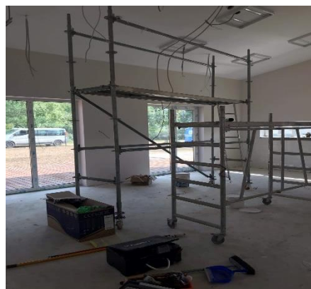
3 Picture. Construction of group living houses in Taurage district municipality, group living houses are administered by Adakavos Social Services House. Summer 2019.