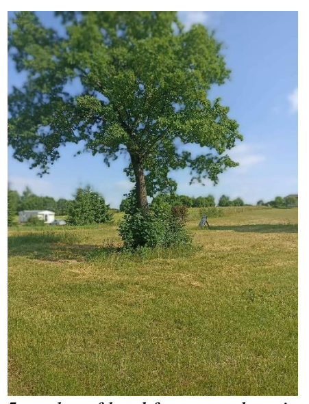
5 p. plot of land for group housing: Naujasodzio 64, Vilnius city municipality

The first group living house will be built on a plot of land provided by the Vilnius City Municipality, in Naujasodziu Street (see picture 4). The second (see picture 5) house for group living will be built for the care of people with intellectual disabilities in Lithuania on its own plot of land owned by society "Viltis".