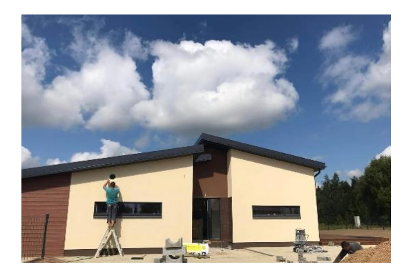
2 p. Group living home: Zalioji str. 22, Norkaichu village, Taurage region

On December 24, 2020, the second home for group living was established in the town of Taurage, where another 10 residents of the Adakavas social service home had settled.