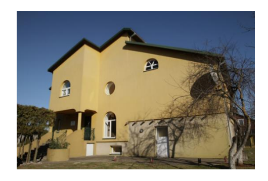
1 p. Group living home: Marių str.19, Tauragė

On May 2, 2019 on May 2, the first group living home was established in the town of Taurage, where 10 residents of the Adakavas social services home had settled.