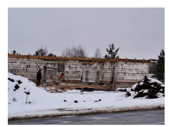
3p. Group living home Smilgu str.2, Lentvarys Traku region municipality

In 2019 Society "Viltis" concluded a contract with Trakai district municipality for the construction of group living homes in Lentvaris and Trakai district municipality. Active construction of group living homes is currently underway; it should be completed in the fall of 2023. Seven persons from the N. Genytė social care home and 3 residents from the municipality of Trakai district will live in this group living home.