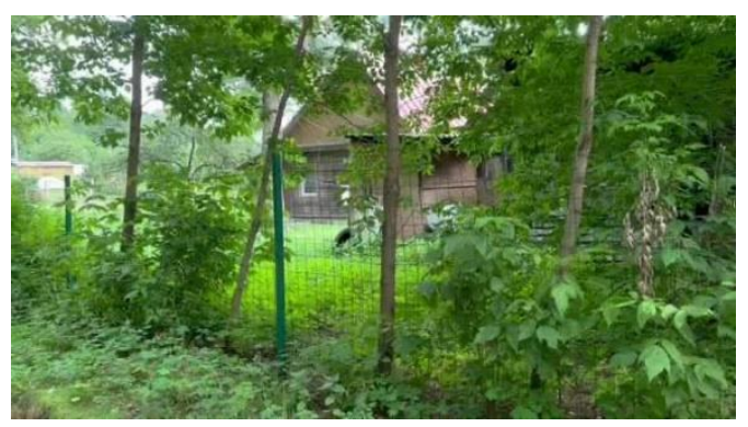
4p. Plot of land for group housing: Plot of land for group living: Pagirio str.16, Vilnius municipality

In 2020 society "Viltis" got involved in the deinstitutionalisation process in the city of Vilnius. Society "Viltis" is a partner of the Vilnius city municipality, which will build two houses for group living in Vilnius. 7 people from the N. Genyte social care home and 3 residents from the Vilnius city municipality will live in this group living home.