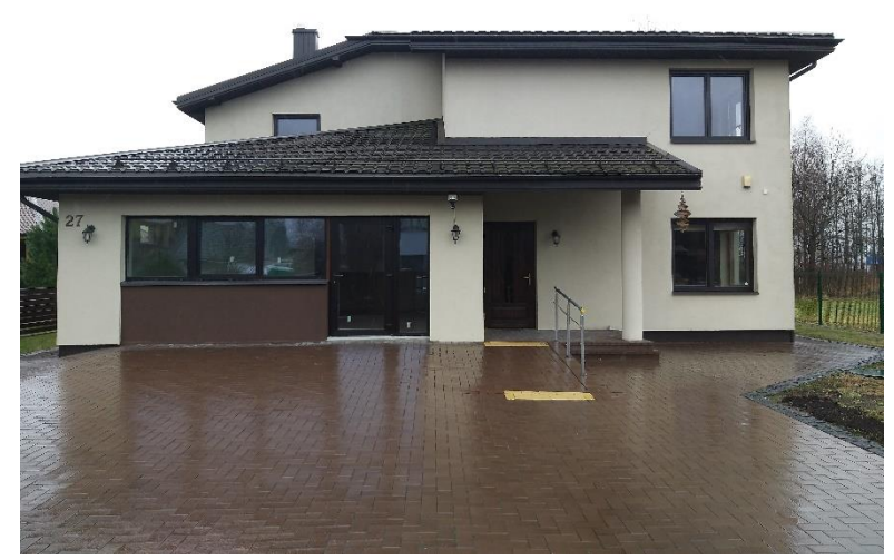
6 p. Group living home:

Also, "Kauno Viltis" is a partner of the Kaunas City Municipality in establishing new group living homes in the city of Kaunas. Currently, a post office has been purchased, which is being reconstructed and rearranged according to the needs of persons with disabilities.