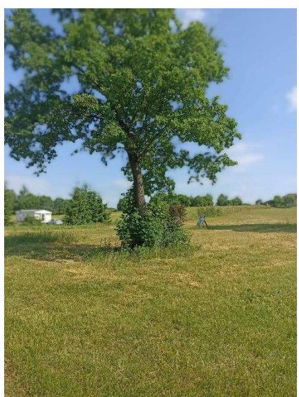
5 p. plot of land for group housing: Naujasodzio 64, Vilnius city municipality

The first group living house will be built on a plot of land provided by the Vilnius City Municipality, in Naujasodziu Street (see picture 4). The second (see picture 5) house for group living will be built for the care of people with intellectual disabilities in Lithuania on its own plot of land owned by society "Viltis".