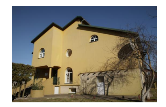
1 p. Group living home: Marių str.19, Tauragė

On May 2, 2019 on May 2, the first group living home was established in the town of Taurage, where 10 residents of the Adakavas social services home had settled.