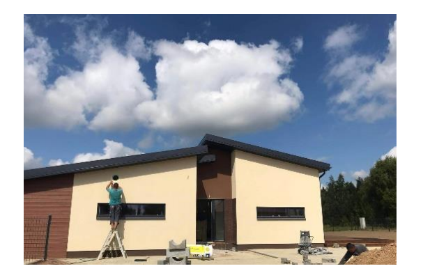
2 p. Group living home: Zalioji str. 22, Norkaichu village, Taurage region

On December 24, 2020, the second home for group living was established in the town of Taurage, where another 10 residents of the Adakavas social service home had settled.