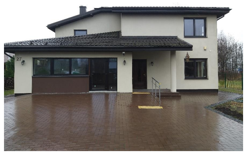
6 p. Group living home: V. Mirono g., 17, Kaunas.

Also, "Kauno Viltis" is a partner of the Kaunas City Municipality in establishing new group living homes in the city of Kaunas. Currently, a post office has been purchased, which is being reconstructed and rearranged according to the needs of persons with disabilities.