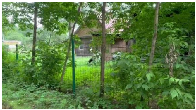
4p. Plot of land for group housing:Plot of land for group living:Pagirio str.16, Vilnius municipality

In 2020 society "Viltis" got involved in the deinstitutionalisation process in the city of Vilnius. Society "Viltis" is a partner of the Vilnius city municipality, which will build two houses for group living in Vilnius. 7 people from the N. Genyte social care home and 3 residents from the Vilnius city municipality will live in this group living home.