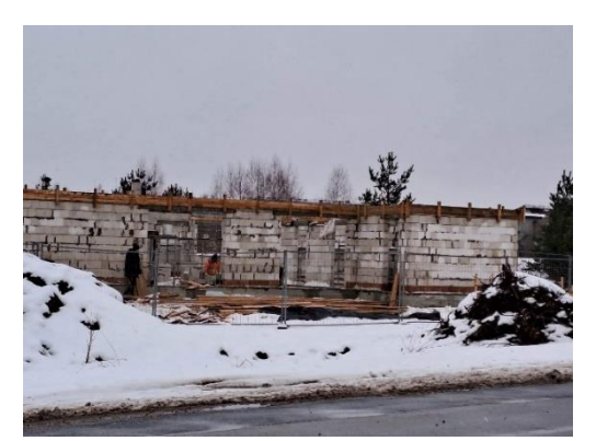
3p. Group living home Smilgu str.2, Lentvarys Traku region municipality

In 2019 Society "Viltis" concluded a contract with Trakai district municipality for the construction of group living homes in Lentvaris and Trakai district municipality. Active construction of group living homes is currently underway; it should be completed in the fall of 2023. Seven persons from the N. Genytė social care home and 3 residents from the municipality of Trakai district will live in this group living home.